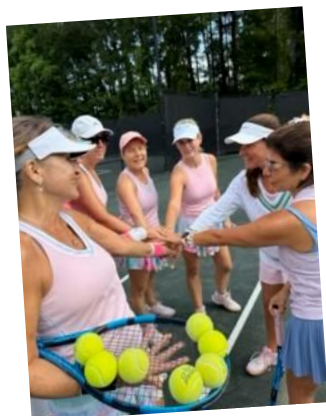
2024-25 GA-FL Women's Tennis League Runners Up