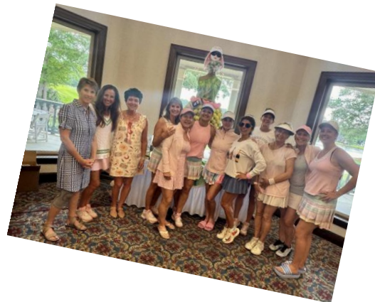
GE Veuve and Volley